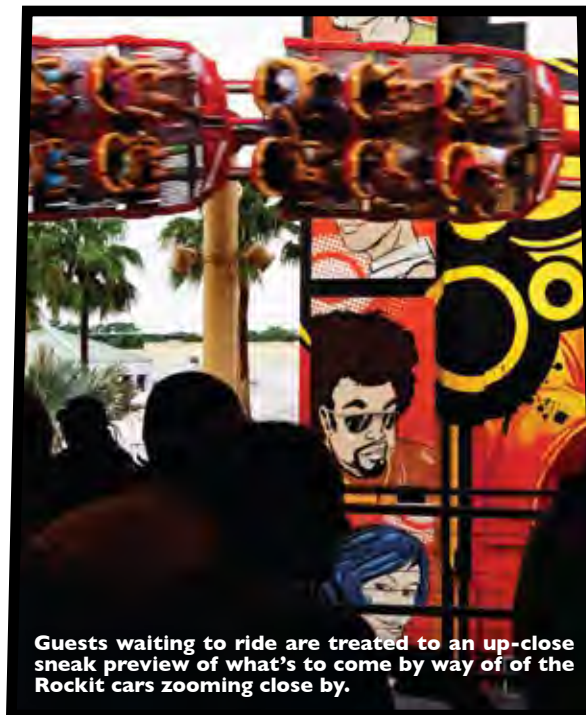
Guests waiting to ride are treated to an up-close sneak preview of what's to come by way of the Rockit cars zooming close by.