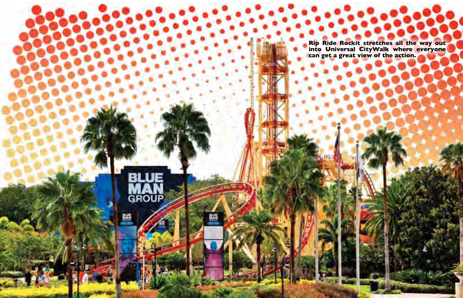
Rip Ride Rockit stretches all the way out into Universal CityWalk where everyone can get a great view of the action.