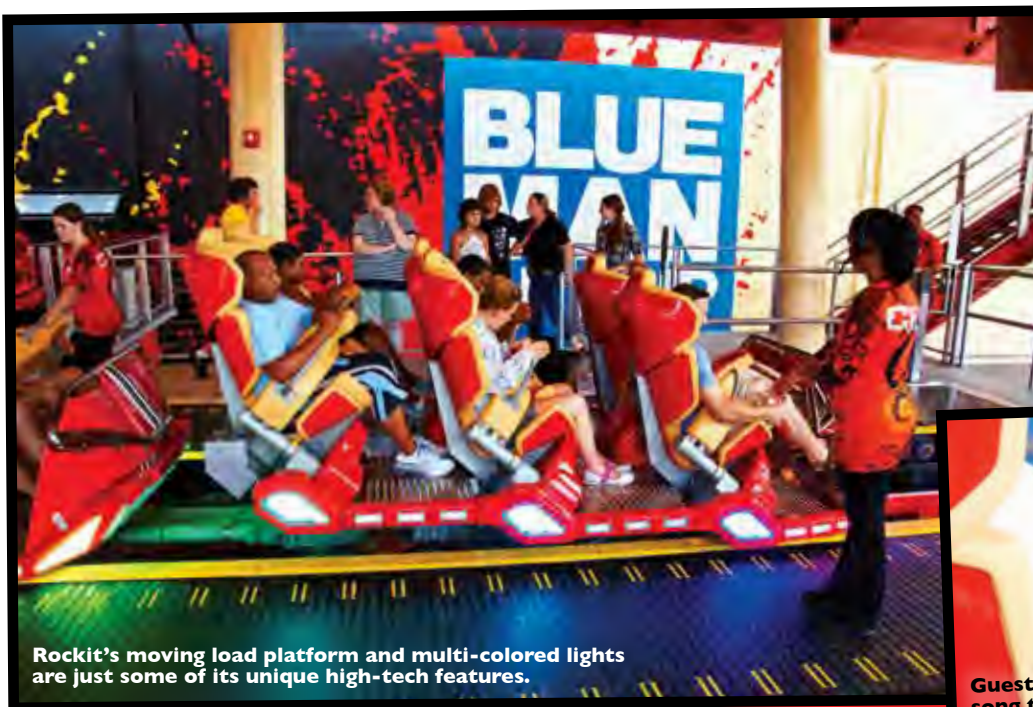
Rockit’s moving load platform and multi-colored lights are just some of its unique high-tech features.

it on the highway at 65 miles per hour, testing different speaker locations and different speakers and different kinds of music until we found exactly the way we wanted it to be on the ride. It was quite the sight to see us all going down the highway on the chairs, but it’s the only way to test it!”