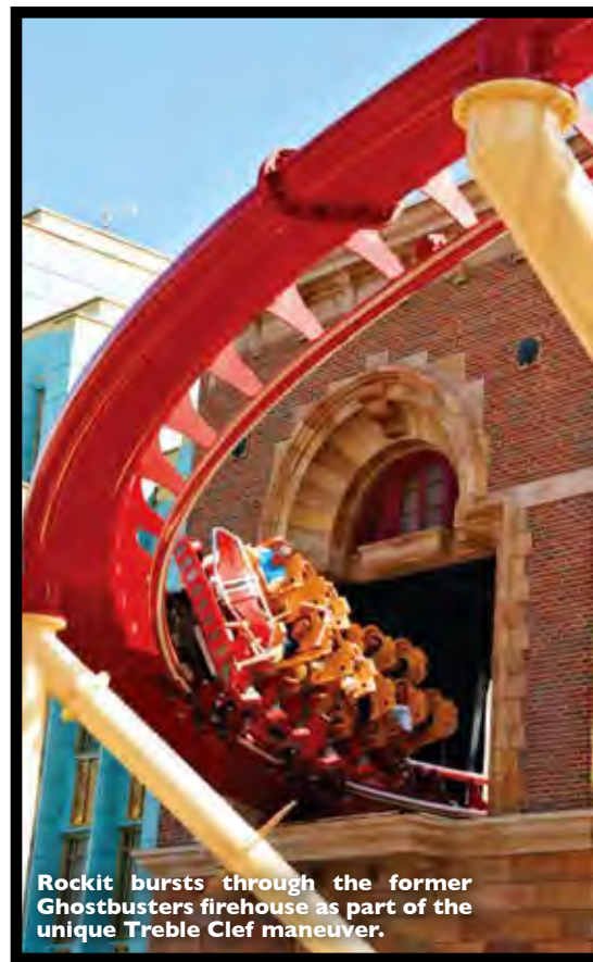
Rockit bursts through the former Ghostbusters firehouse as part of the unique Treble Clef maneuver.

crowd; and the Plot Twist, which has an inclined loop, a 150-degree banking turn, and a final 360-degree turn before heading back to the loading station. Overall, it's a fast-moving ride that feels much longer than many roller coasters and offers several breath-takingly fun tricks not offered anywhere else. And the personalized music really does add to the overall experience, as you choose different songs with every ride – or not.