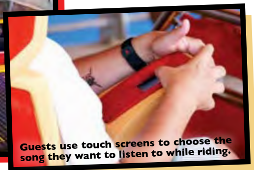
Guests use touch screens to choose the song they want to listen to while riding.

Letting guests customize their ride experience by choosing their own song is something no other coaster in the U.S. offers. Rockit has a 30-song playlist, with tracks from some of today’s and yesterday’s biggest stars from five different genres –