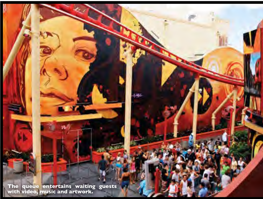
The queue entertains waiting guests with video, music and artwork.