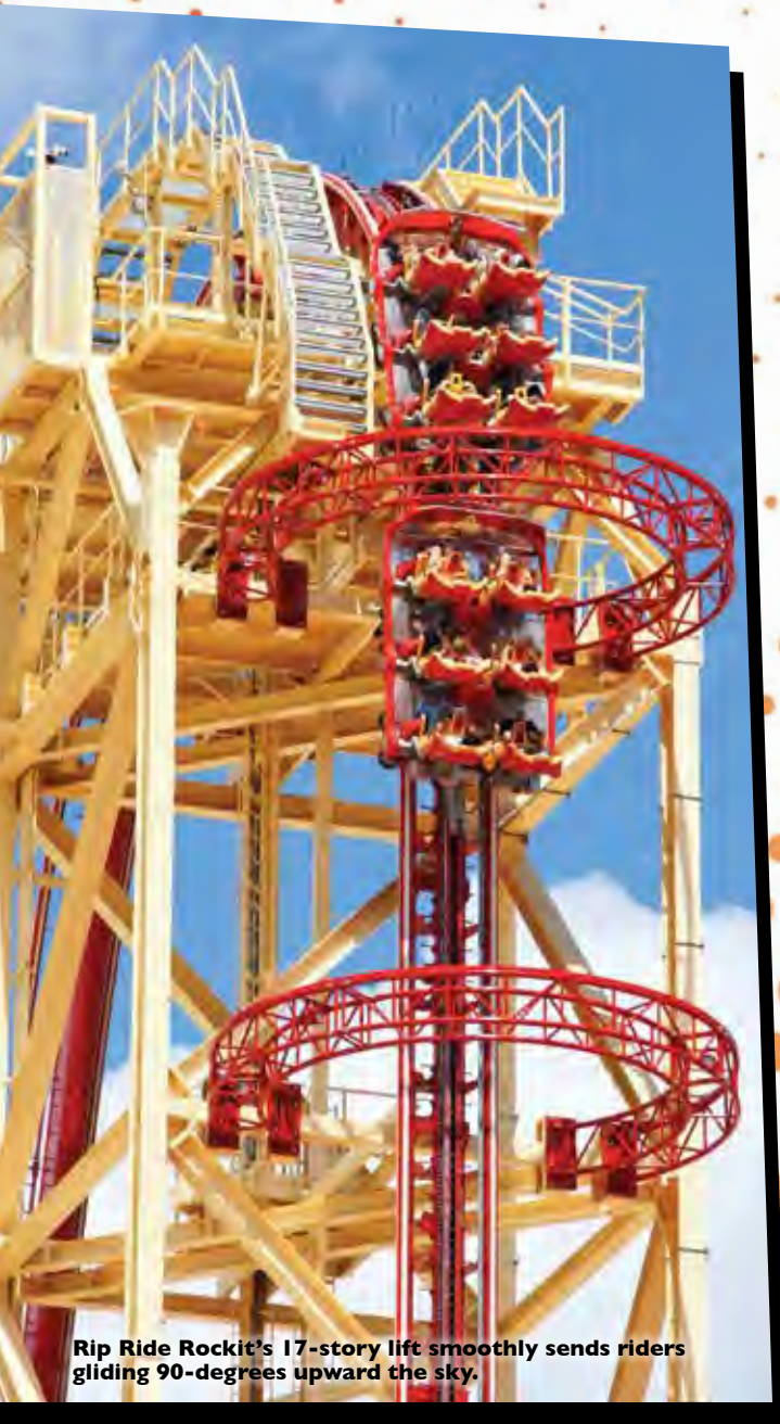
Rip Ride Rockit's 17-story lift smoothly sends riders gliding 90-degrees upward the sky.

by DEBORAH BRAUSER