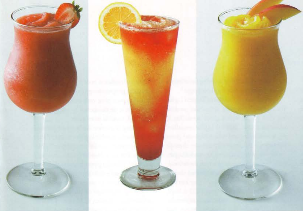
Island Oasis has launched its successful "Flavor of the Month."