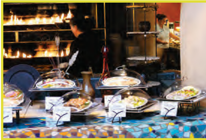
Eat up! Several food choices are offered at the park throughout the day, including hot dishes and sandwiches for lunch.

Meals include a light continental breakfast and several lunch options including hot offerings such as pasta or seafood dishes, or cold choices such as salads