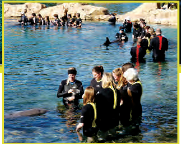
Various groups participating in the dolphin experience.

The allotted time ends with each guest getting a chance to actually "swim" with the interaction's star by holding its dorsal fin as it tows you into shore. This part is exhilarating but also a little scary (like all good rides). The swim gives you a chance to see how strong they are. What does it feel like?