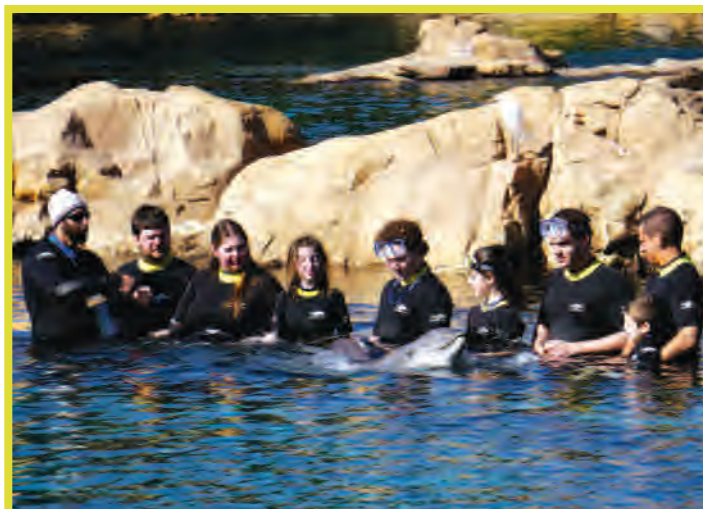
The main draw: interaction with the park's friendly dolphins

As one of the parks under the SeaWorld Parks and