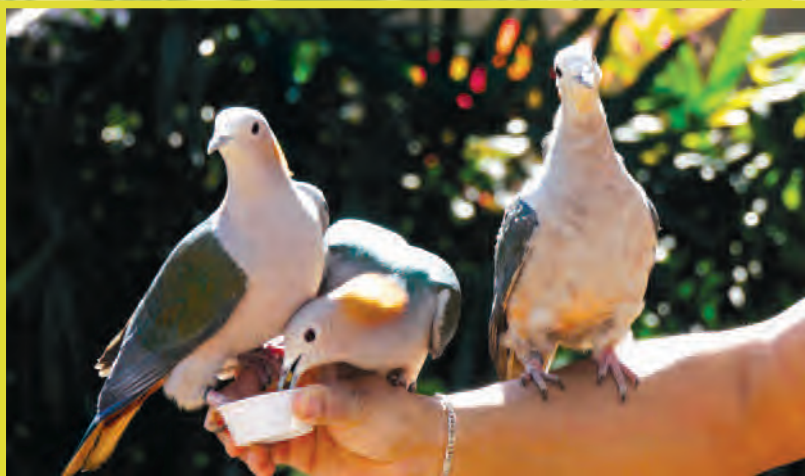
Some of the many inhabitants of the Explorer's Aviary.